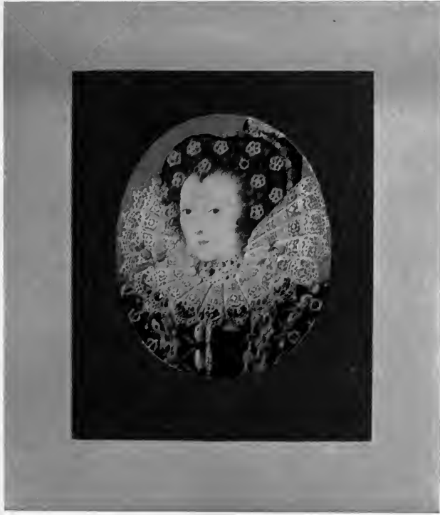
QUEEN ELIZABETH BY NICHOLAS HILLIARD